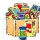
THANKSGIVING FOOD BOXES

If you would like a food box for Thanksgiving please call the parish office and leave your name, phone number and how many in your family.